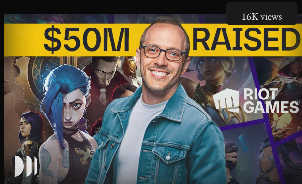
Riot Games Is Spending Millions on Causes Gamers Care About