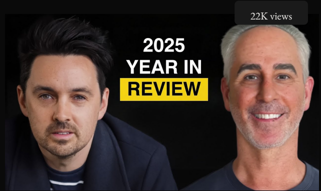
The Best Games, Films & TV of 2025 -- Ranked Honestly