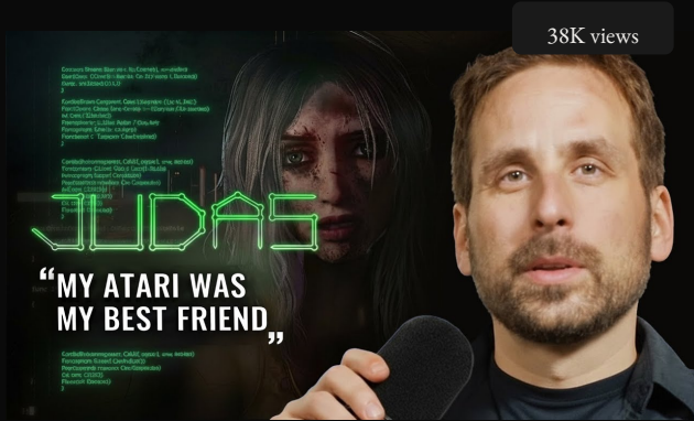
BioShock Creator Reveals What Almost Killed the Game

High-production, long-form interviews with the biggest names in gaming, entertainment, and beyond -- consistently reaching thousands of engaged viewers.