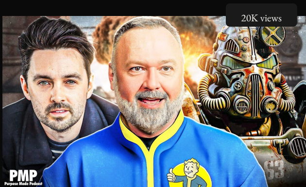
The Fallout Creator Told Me Things He Regrets